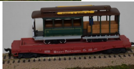
Blaze Lyn- Styl