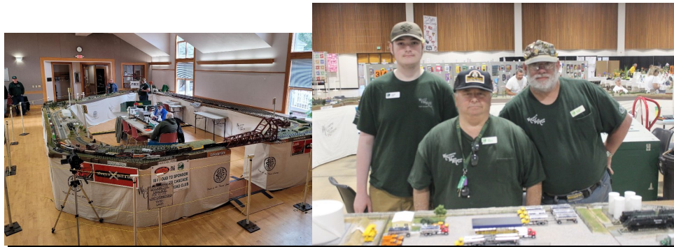
Enjoying our new meeting place.