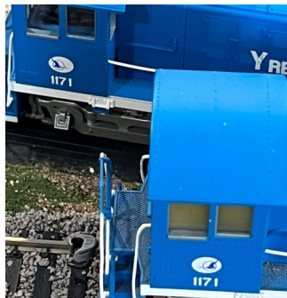
photo [3]- Top - correct Blue Goose logo, Bottom - incorrect Blue Goose logo