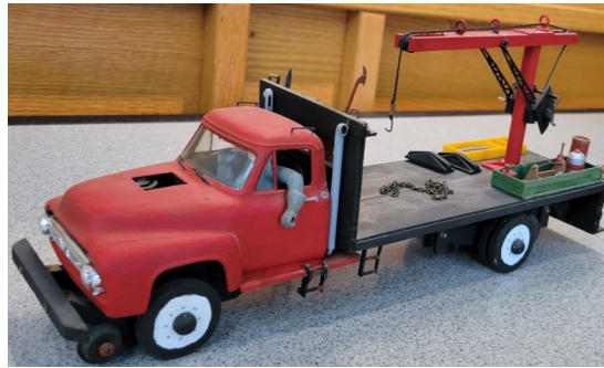
Dale Knox-G Scale