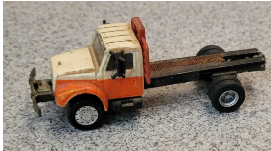
Hill Hoffmen-HO Scale