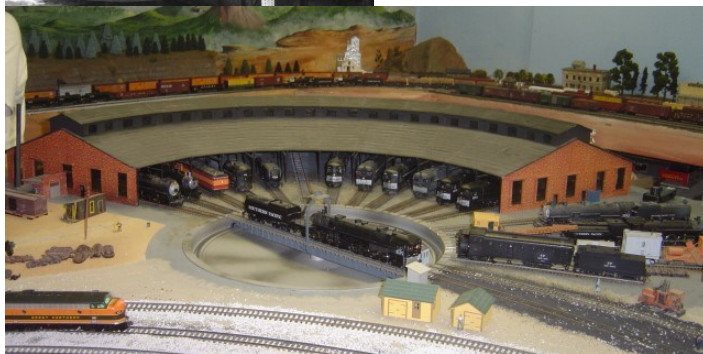
Photo - Dunsmuir Turntable and Roundhouse on the D&CFMRRC layout - 7 Jul 2007