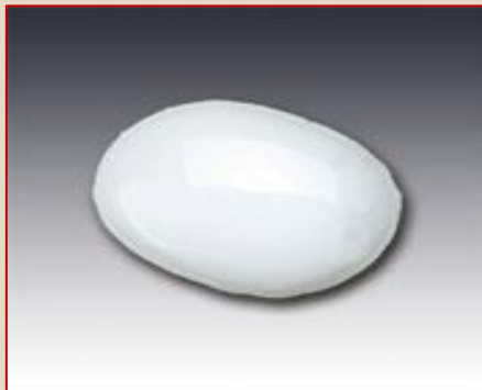
4" Oblong White