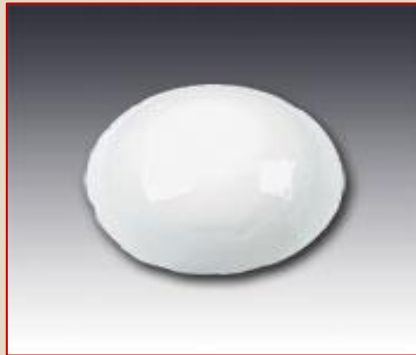
6" Round Channel Yellow / White