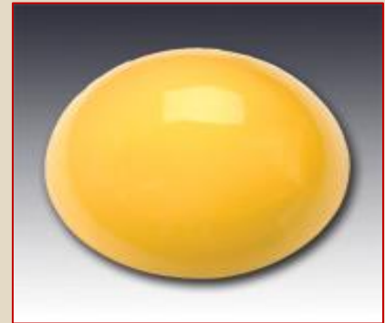
8" Round Channel Yellow / White