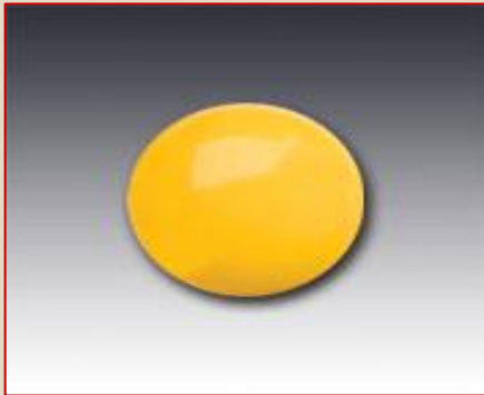
4" Round Yellow / White