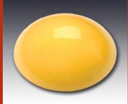
8" Round Channel Yellow / White