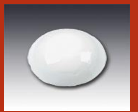
6" Round Channel Yellow / White