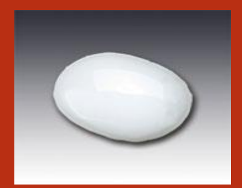
4" Oblong White