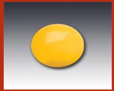
4" Round Yellow / White