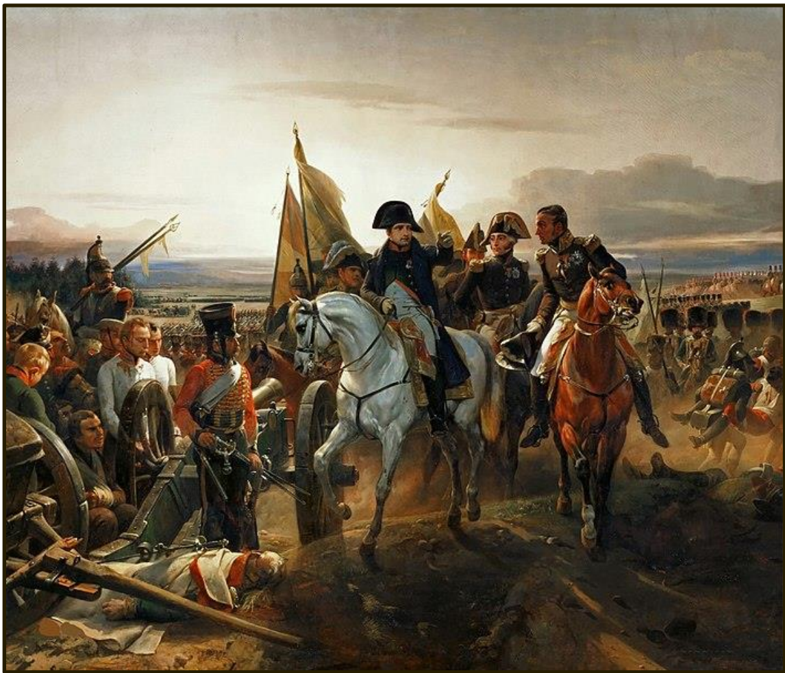
Battle of Friedland, Horace Verney

Over 375 Soufflenheim soldiers from 1739 to 1896. Found in the regimental registers (muster rolls) and other records, including inventory, church, civil, census, medal, naturalization, pension, and draft cards.