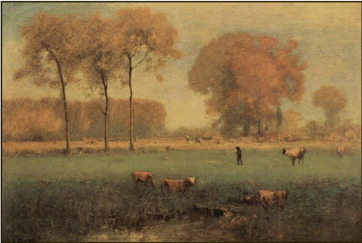
Indian Summer. George Inness

Many from Soufflenheim emigrated to East Eden in Erie County, New York and the surrounding area, including Buffalo, from the late 1820's onwards. By 1840 it had become an almost entirely German area.