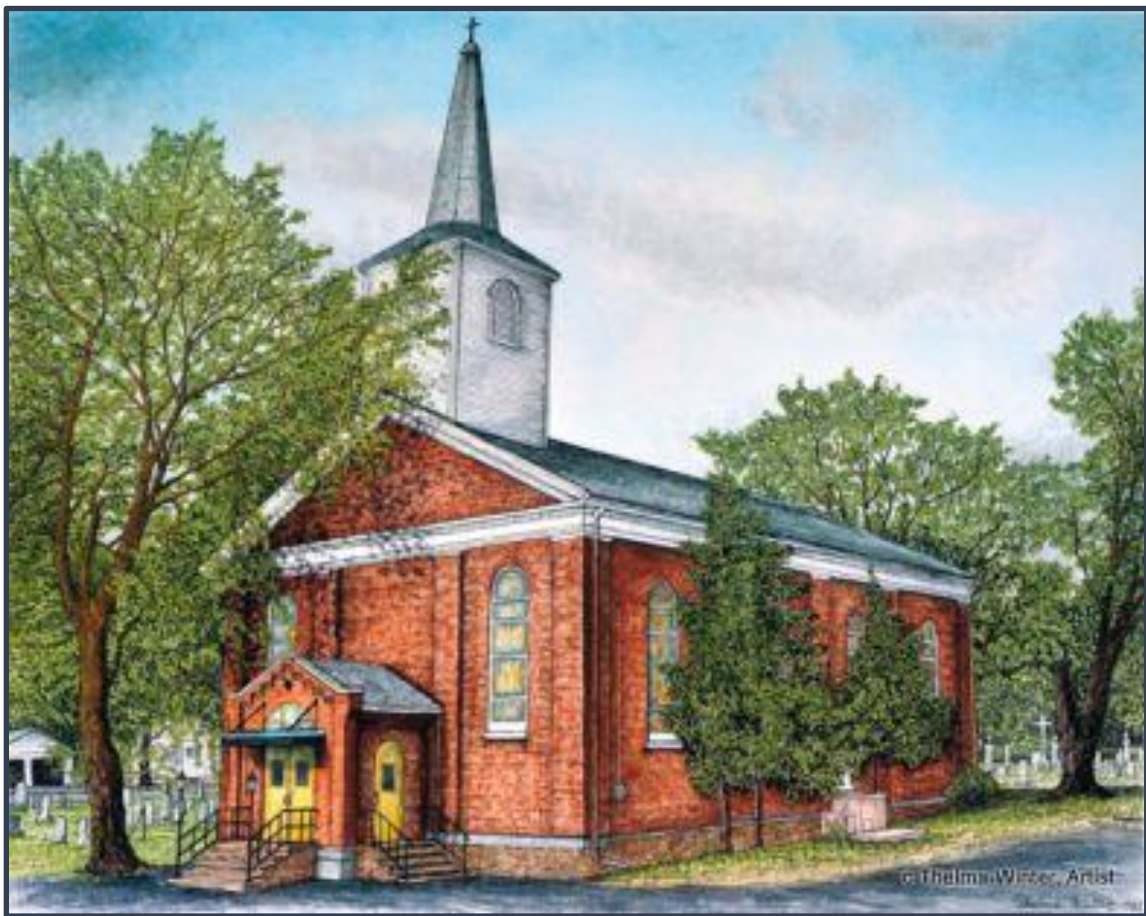
Saint Mary's Church, East Eden, New York, Thelma Winter

St. Mary's records from 1861 to 1917 were filmed in 1982. Found online at FamilySearch: baptisms 1861-1917, marriages 1861-1917, deaths 1861-1917. Film Number 1292945. Image Group Number (DGS) Format 8273109.