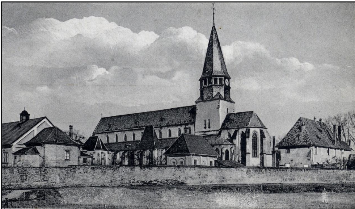
Saint Nicolas, Haguenau, 19 th Century

Church records from St. Michael's in Soufflenheim begin in 1743. Earlier records are found in other communities, particularly in Haguenau during the 17 th century.