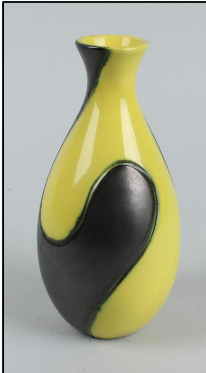
Leon Elchinger, Ceramics Elchinger, Soufflenheim

New Soufflenheim Research : March 30, 2025