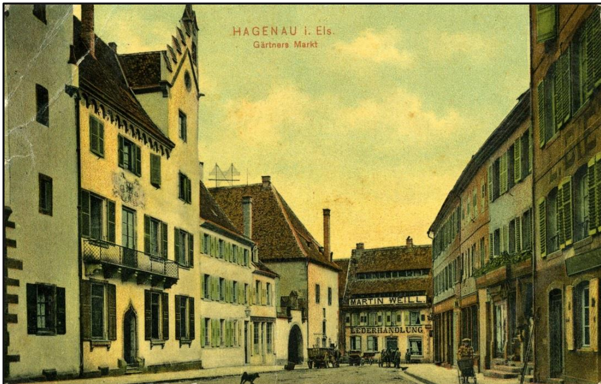
Chancellery Building (Left), Haguenau, Built 1484

The oldest Soufflenheim records are found in the Ancient Archives (Old Archives) at the Archives of Bas-Rhin in Strasbourg from 1315 to 1790, and the Haguenau Municipal Archives from 1334 to 1790.