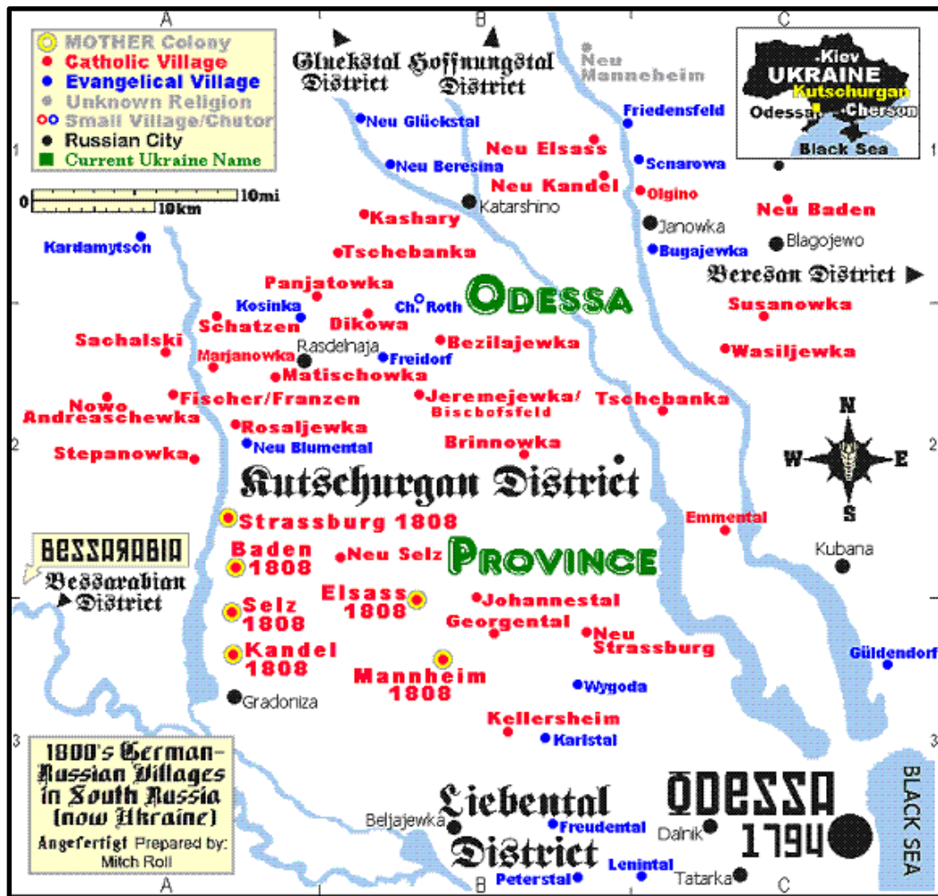
Kutschurgan District, Cherson, South Russia. http://www.rollintl.com/roll/kutschurgan.htm