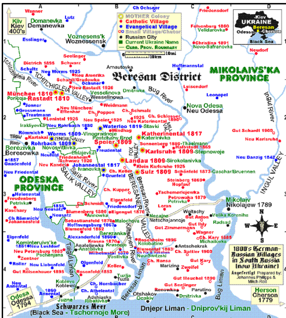
Beresan District. South Russia. http://www.rollintl.com/roll/beresanmap.htm