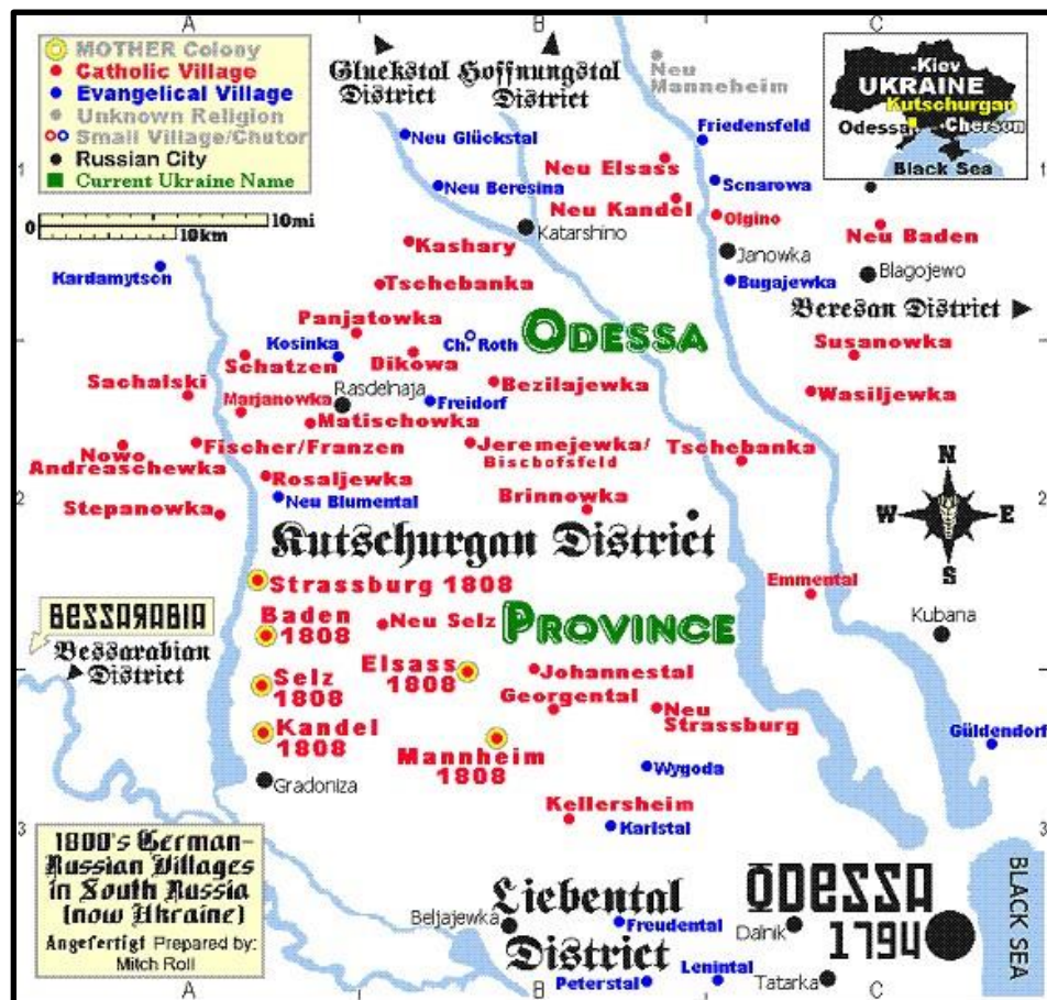
Kutschurgan District, Cherson, South Russia.