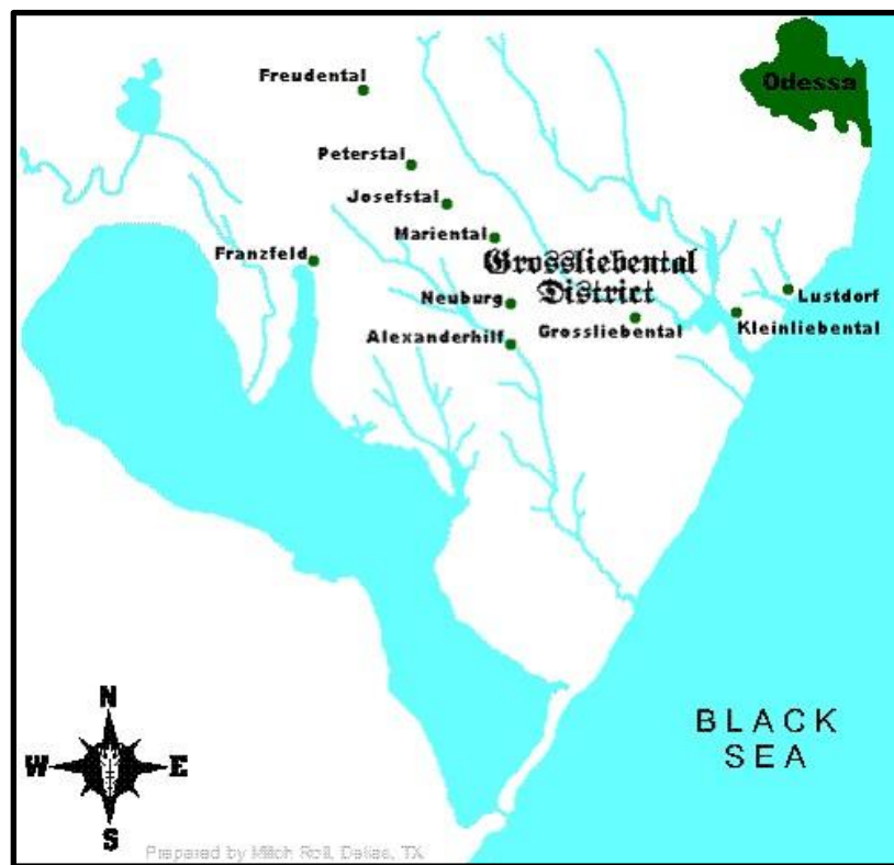
Grossliebenthal District, Odessa. By Mitch Roll, Roll International

"Kleinliebental was settled in 1804 by immigrants from various regions of Germany. Sixteen families destined for this colony had arrived in Russia in 1803, but because the land had not yet been purchased for them, they had to be quartered in Odessa. In March 1804, 48 families arrived and settlement was begun. There were 50 lots measured out, 25 on the east side and 25 on the west side of the river. On every lot a reed hut was built as a shelter for the people and the meagre belongings that they had brought with them. So Kleinliebental came into existence. In 1805, 20 more families arrived; in 1807, one; in 1808, four; and in 1809, seven, making a total of 82 households." From The German Colonies in South Russia 1804 to 1904 by Conrad Keller.