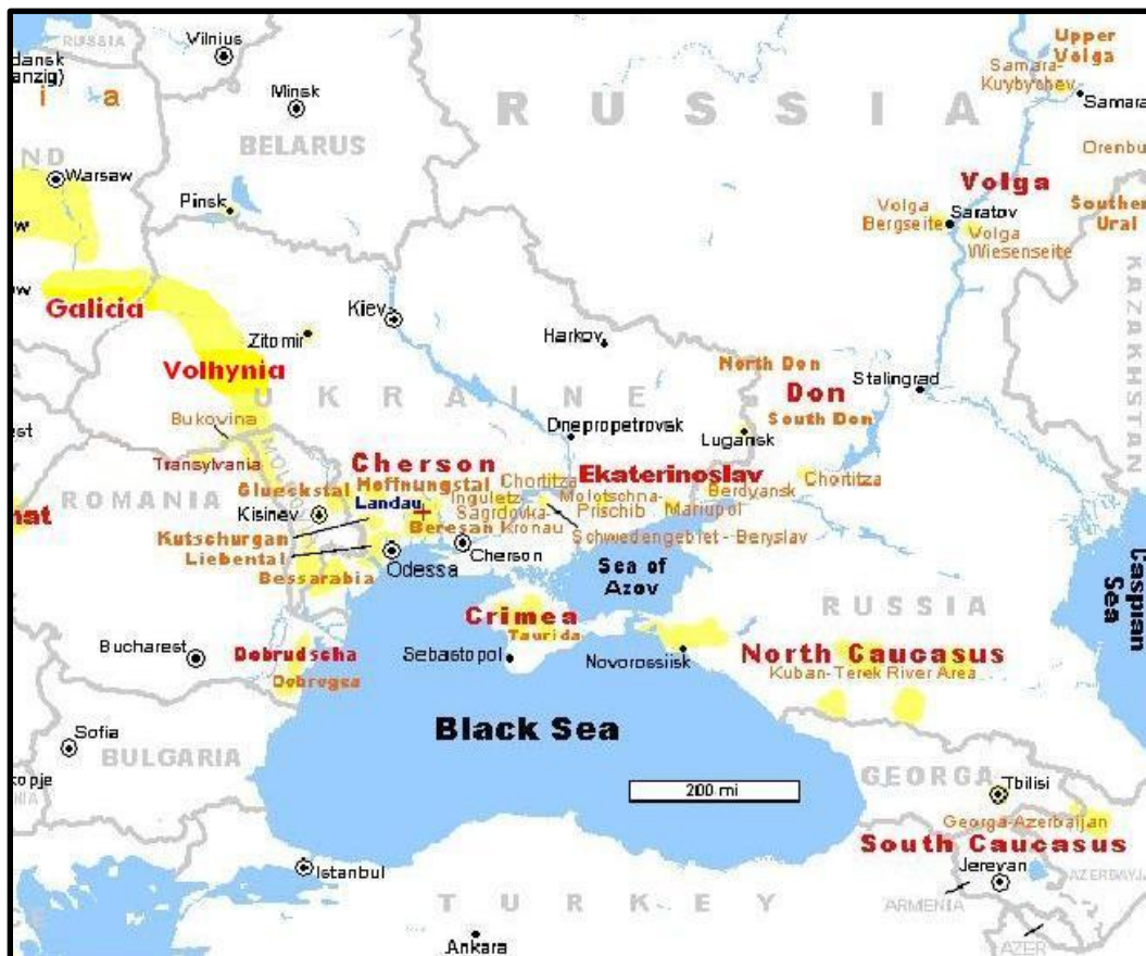
Present day countries and German settlement areas in the 1700's & 1800's. By Mitch Roll, Roll International