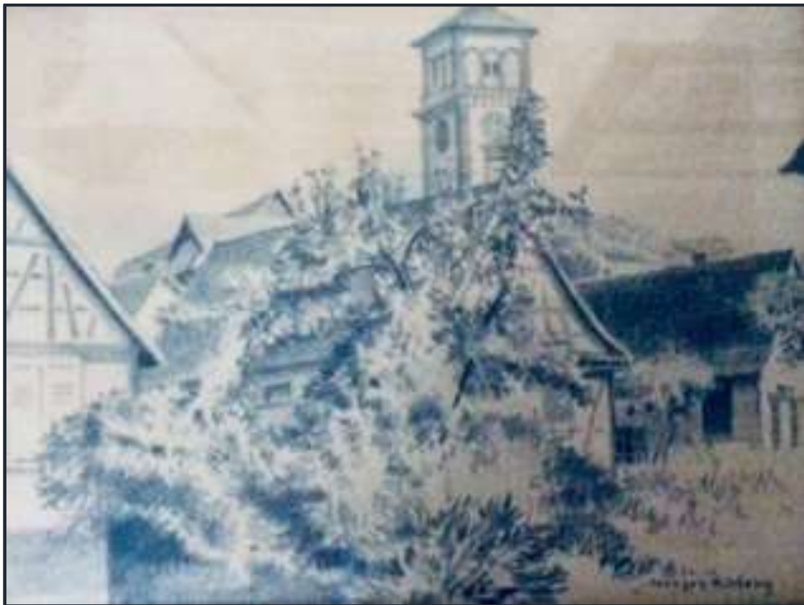
Soufflenheim, Georges Ritleng, 1900 (Blue Charcoal), Courtesy of Marc Elchinger

Soufflenheim house records from 1368 to 1811 in the ancient archives, inventories, contracts, and marriage contracts.