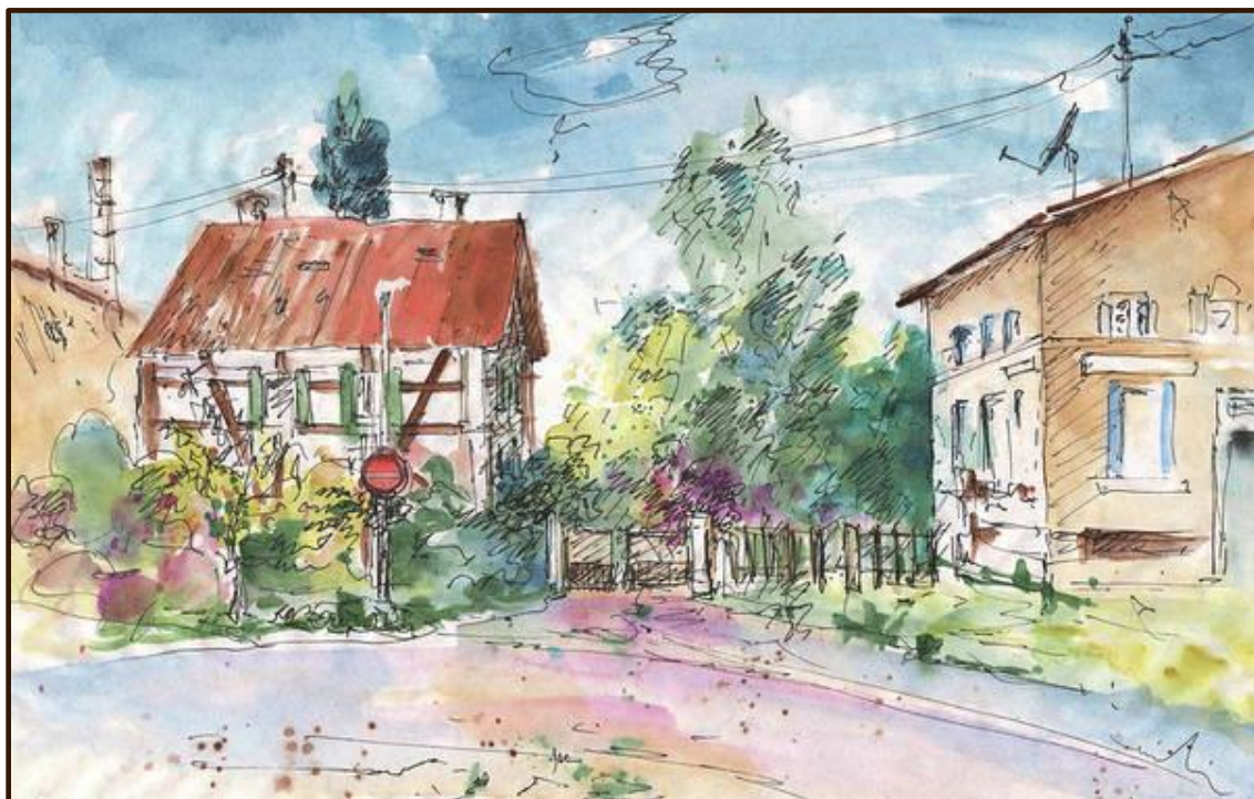
Houses in Soufflenheim, Miki De Goodaboom, , c. 1998