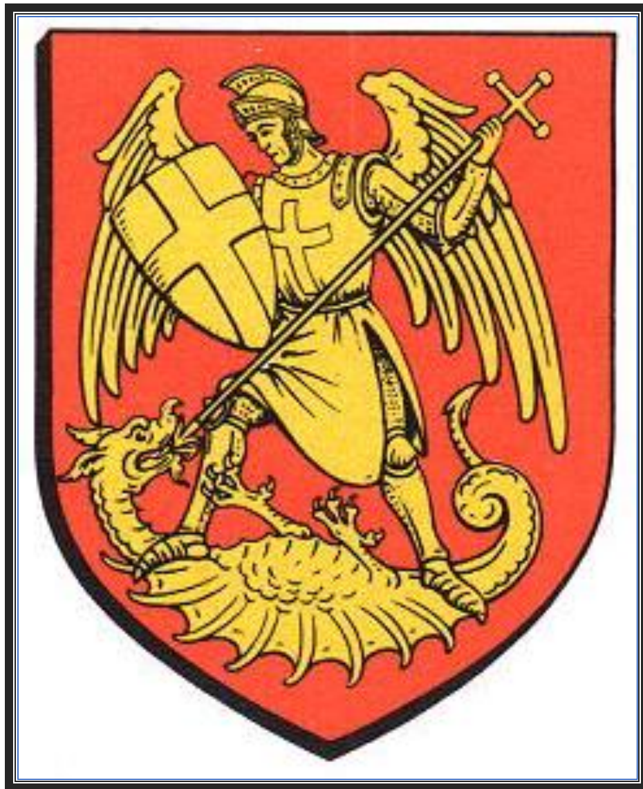
The Soufflenheim coat of arms with a winged St. Michael, patron saint of the village, killing the dragon. The arms were originally granted in 1697 on a blue shield, as gold and blue were the royal colors. The present colors are those of Alsace.

New Soufflenheim research : March 21, 2024