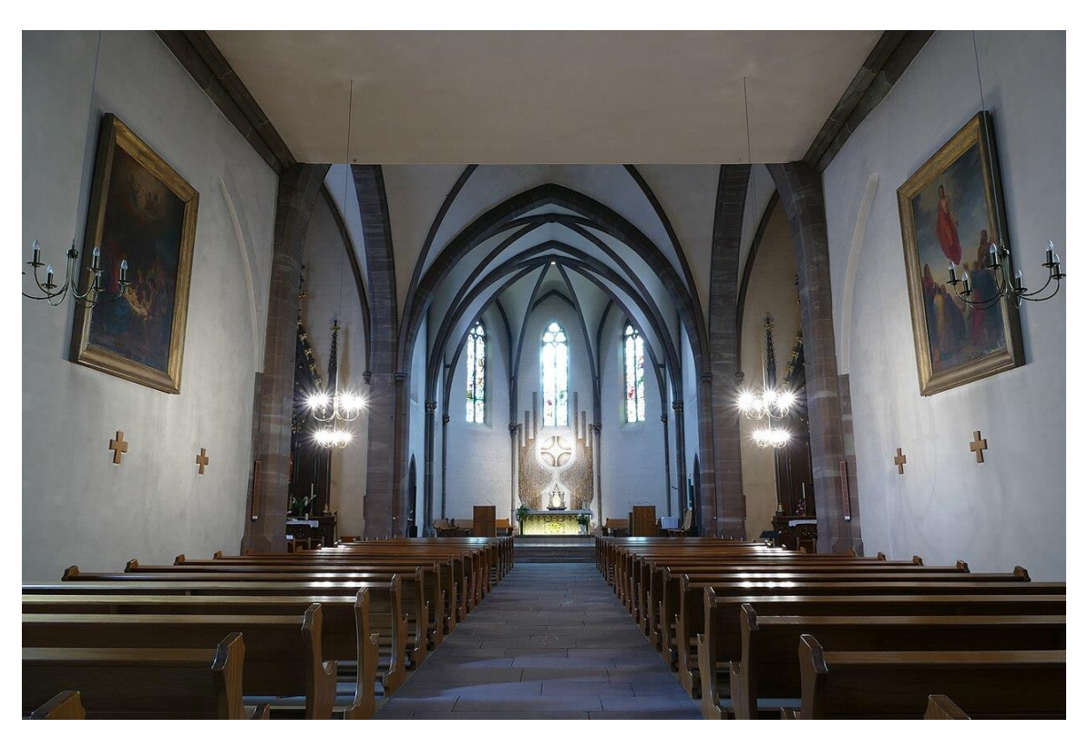
Interior view of the nave towards the choir.