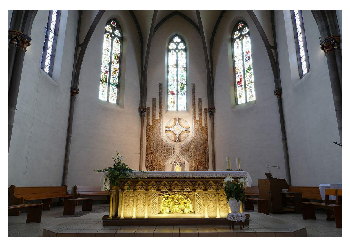
Neo-Gothic high altar (19th century), originally from the old church in Soufflenheim.