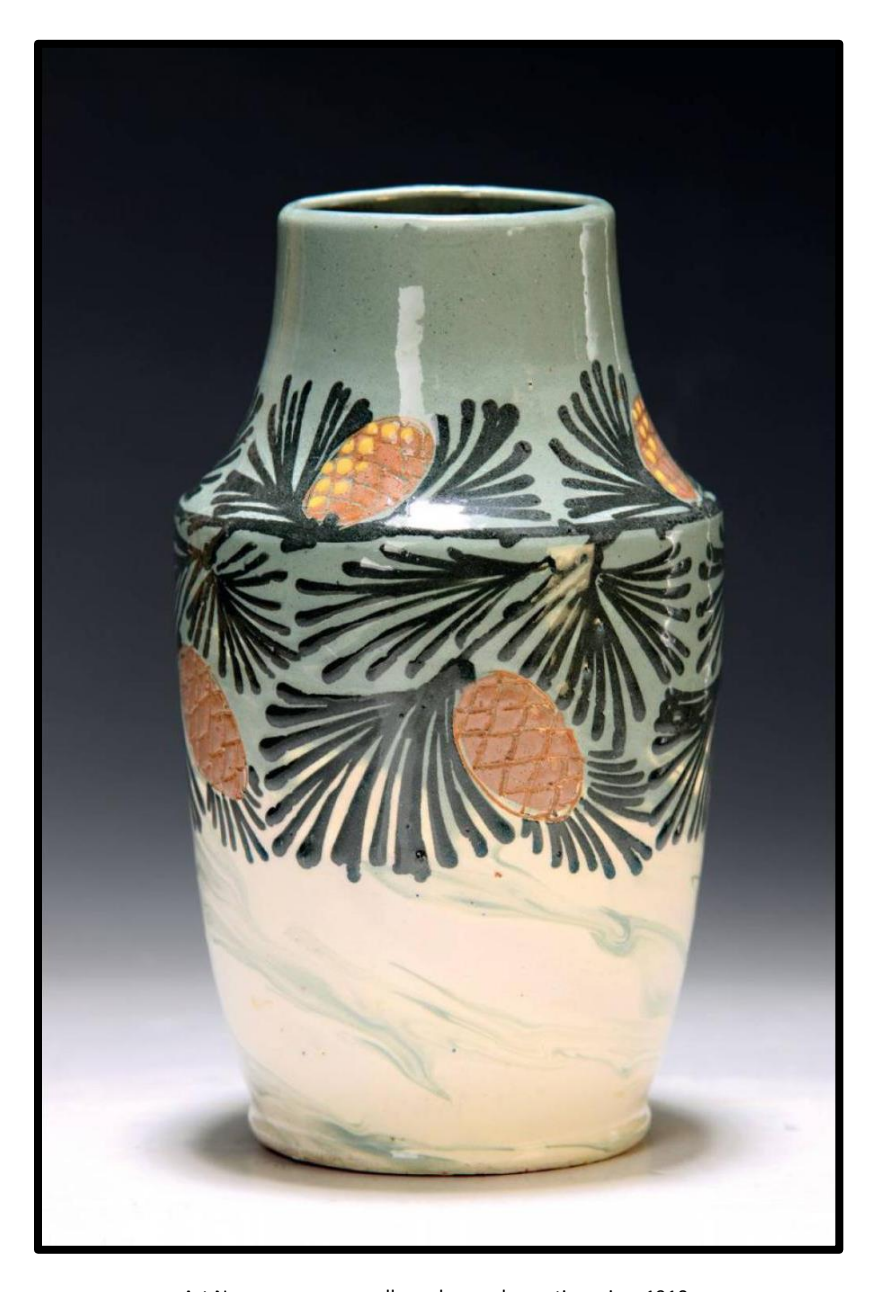
Art Nouveau vase, needle and cone decoration, circa 1910, Léon Elchinger, Ceramics Elchinger, Soufflenheim