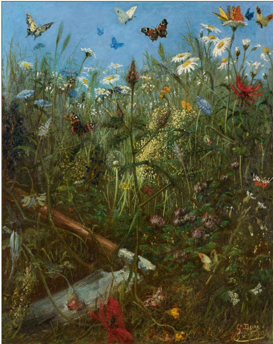
The Meadow , Gustave Dore

Sources of information for genealogical and historical research in Soufflenheim.