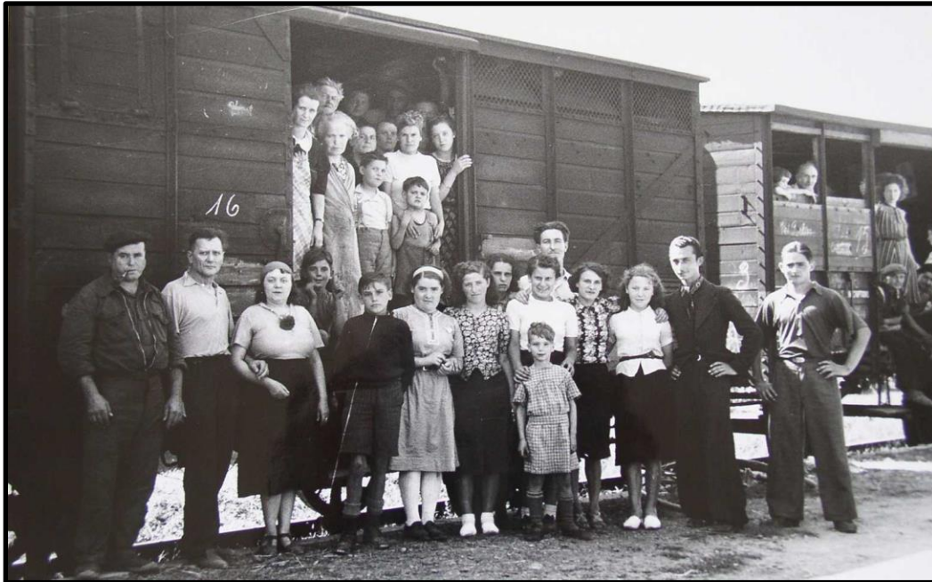
The evacuation of the Alsatians and Moselle in September 1939