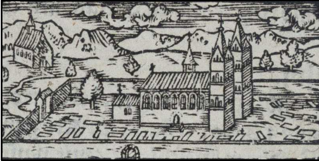
General view of Murbach Abbey (1600), Digital Collection Originals of the BNU Strasbourg, Gallica BnF.