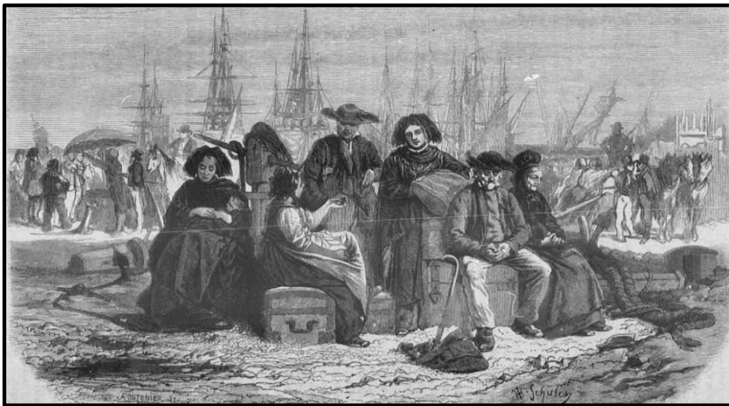
Les émigrants, engraving after a painting by Théodore Schuler, 1861, Gallica BnF