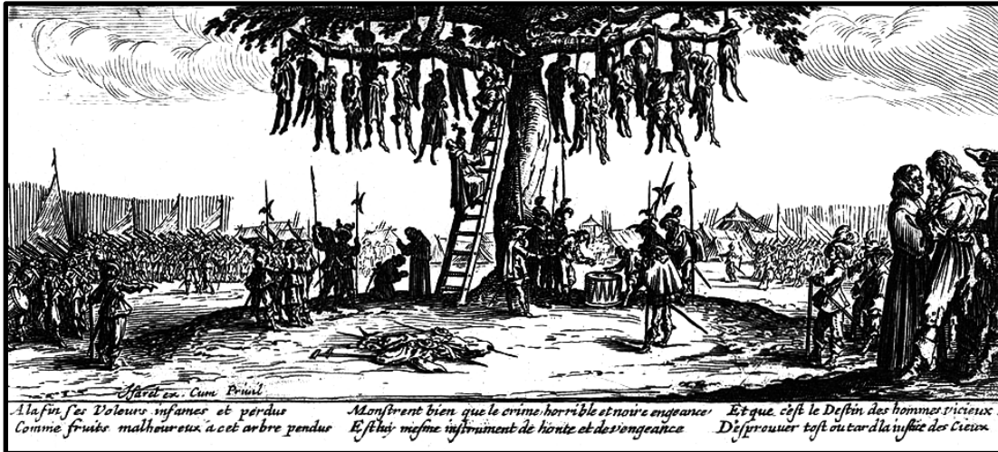
[Les Hangés by Jacques Callot, Musée Lorrain (An Episode of the Thirty Years War in Sungau in 1633) [As far as I know.]

the Treaty of Munster, included in the name "Treaties of Westphalia" (1648), the King of France obtained the Habsburg possessions in Haute-Alsace and rights to the Decapolis (Mulhouse and Strasbourg were excluded from the treaty).