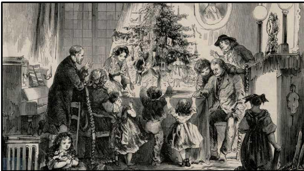
Christmas scene in an Alsatian family , "Christmas in Alsace"