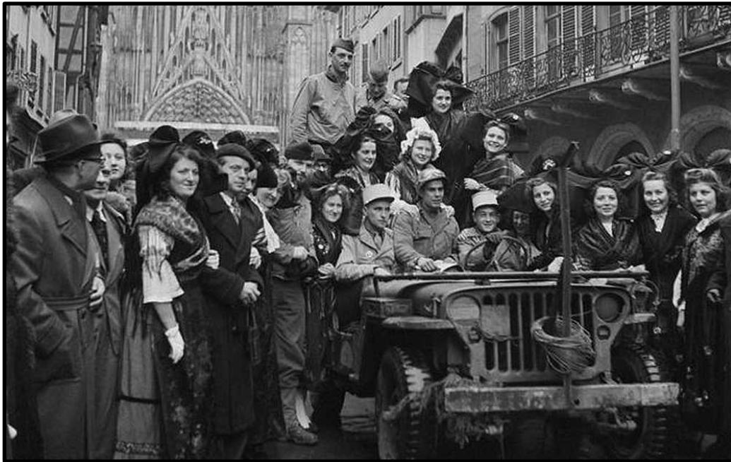
The Liberation of Strasbourg the 2nd D.B., November 23, 1944 sur Kuriocity