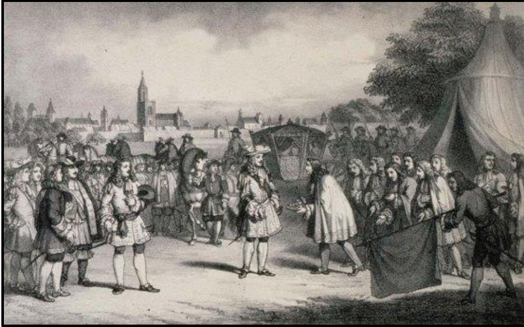
Capture of Strasbourg (30 September 1681): Reception of Louis XIV by the magistrate of Strasbourg Picturesque France