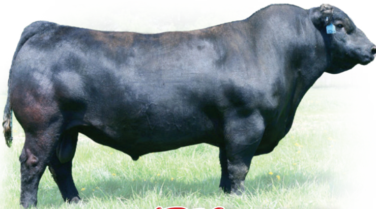
LD Capitalist 316