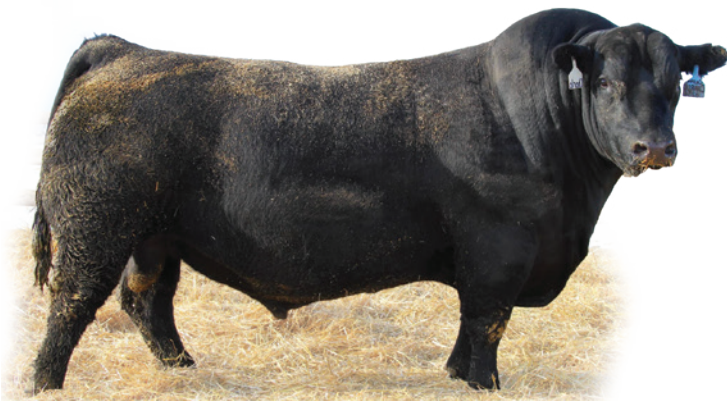
Coleman Charlo 0256

We'll just jump right out with what I feel is the best bull in the offering. We still have some Charlo straws and we use it sparingly. If I could go back and stash more straws in a tank I would. He's masculine, he's long, he's stout, he's bold in his shape without becoming coarse. His combination of fleshing ability and real growth are hard to find in a single package. Out of a 9 year-old cow to boot. Before you put a cap on your bid, remember he looks like this without being fed anything more than a grass stocker ration.