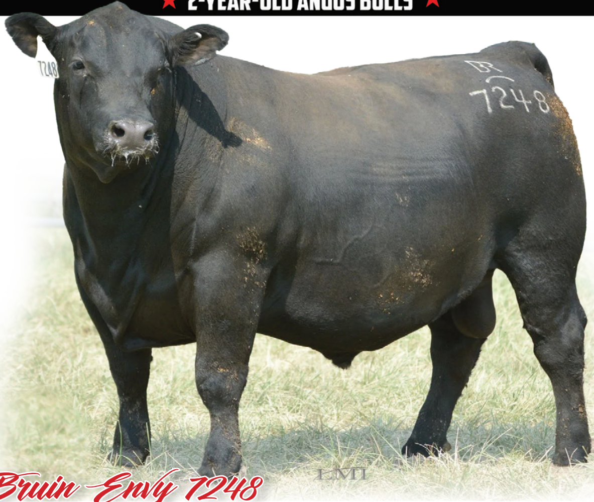
Bruin Envy 7248