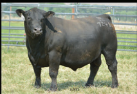
TJ ARROWHEAD & MORE!