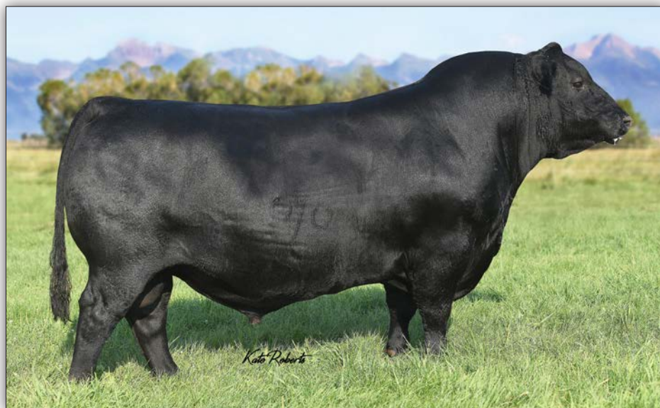
COLEMAN BRAVO 6313 - Sire of Lots 10-20