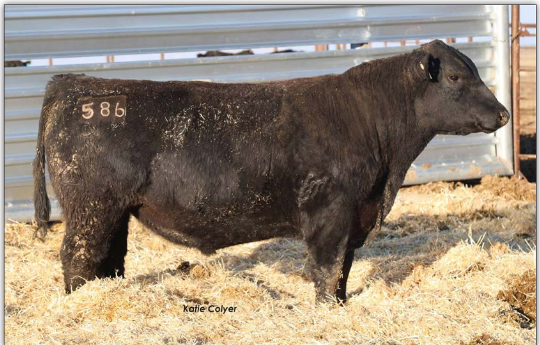
LOT 46 - 586

SIRE CCR COWBOY CUT 5048Z TJ Franchise 451D TJ MISS NET WORTH U11 BW: 74 - 205 WT: 796 - SC:40 DAM Diamond In The Rough 797B SGC 586 Diamond Angus