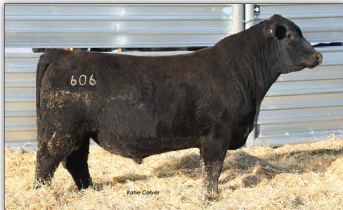
LOT 12 - SGC Bravo 606B 2023

LOT 10 SGC BRAVO 734B 2022 BD: 04-02-2022 | BULL 20874366 | TATTOO: 734B