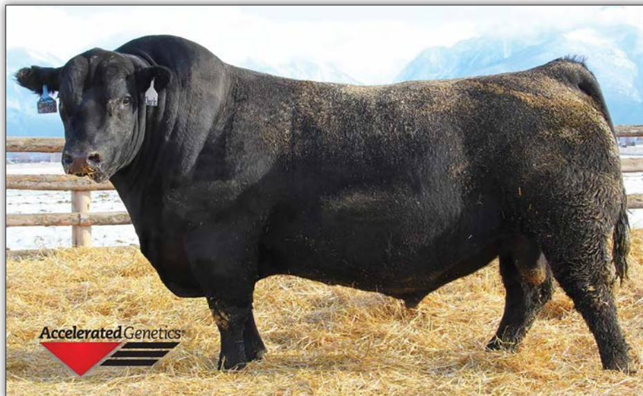
COLEMAN CHARLO 0256 - Sire of Lots 21-23

LOT 21 SGC CHARLO 605B 2022 (DOP) BD: 03-29-2022 | BULL 20874377 | TATTOO: 605B