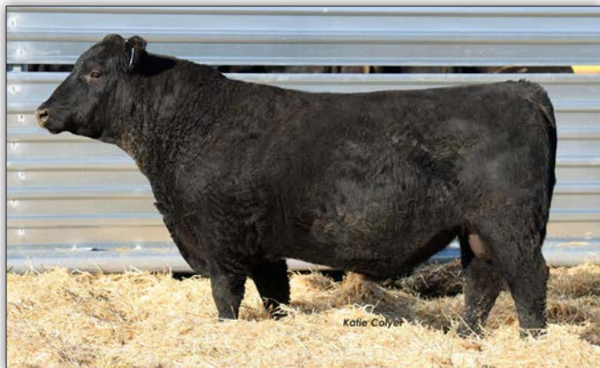
LOT 14 - SGC Bravo 316B 2024

LOT 14 SGC BRAVO 316B 2024 [TOP-OP] BD: 03-31-2022 | BULL 20874370 | TATTOO: 316B