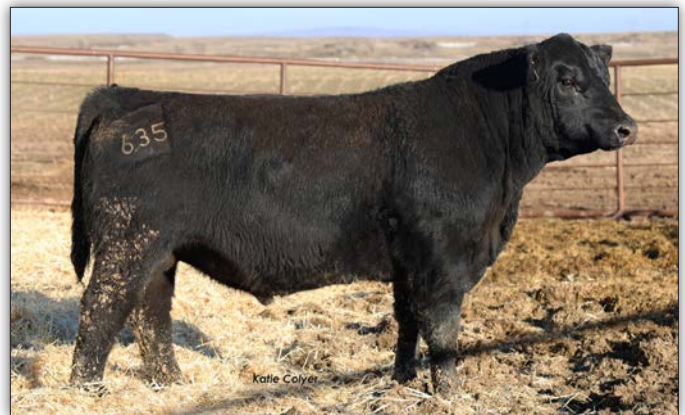
LOT 49 - 635

CCR COWBOY CUT 5048Z SIRE TJ Franchise 451D TJ MISS NET WORTH U11 BW: 86 - 205 WT: 818 - SC:41 DAM SGC First Priority 13218 SGC 635 Priority Angus