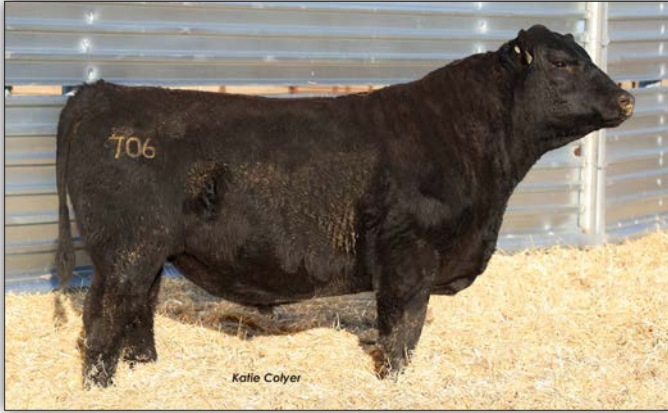
LOT 47 - 706