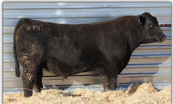
LOT 57 - 874

SIRE: Hooks Eagle 6E TECS HYDROPOWER 23H CDI Miss Power Grid 31D BW: 80 - 205 WT: 801 - SC:41 DAM: Diablo 666D SGC 874 Diablo SGC 530 Regis