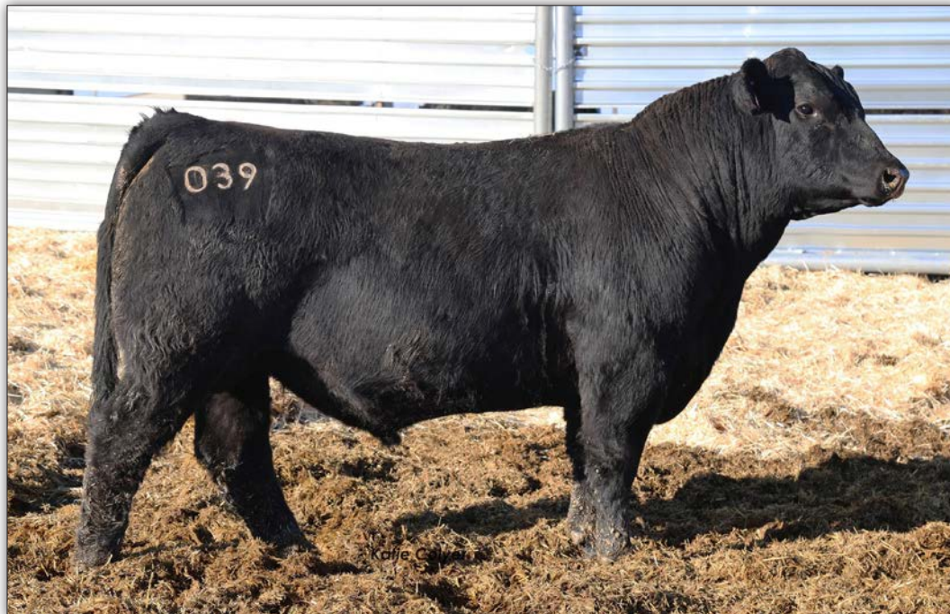
LOT 2 - 039H