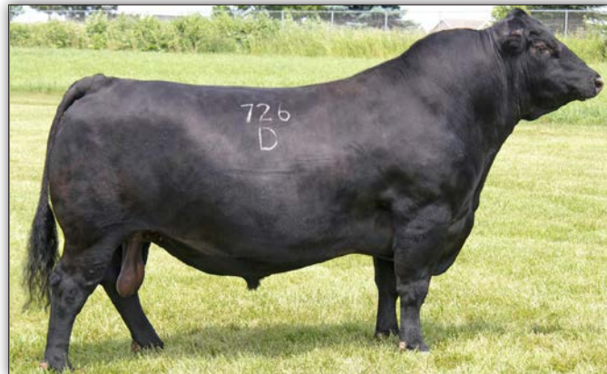
SITZ STELLAR 726D - Sire of Lot 24

LOT 22 SGC CHARLO 602B 2022 (DOP) BD: 03-27-2022 | BULL 20874378 | TATTOO: 602B