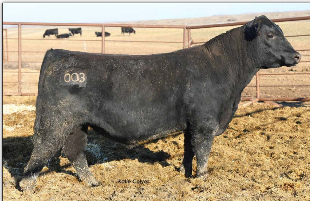
LOT 3 - 003H