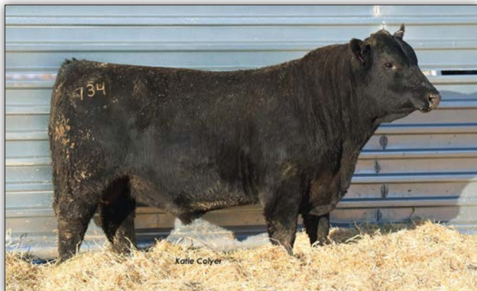
LOT 10 - SGC Bravo 734B 2022