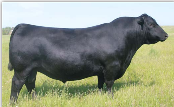
S A V RAINFALL 6846 - Sire of Lots 1-9