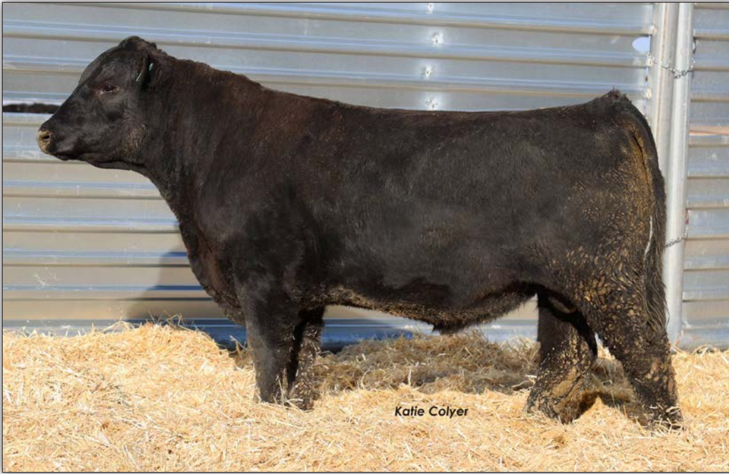
LOT 45 - 383

LOT 45 383 BD: 3/22/2022 | 3/4 ANGUS 1/4 SIMMENTAL BULL | TATTOO: 383