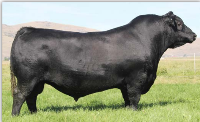
COLEMAN BRAVO 6313 - Sire of Lots 16-26