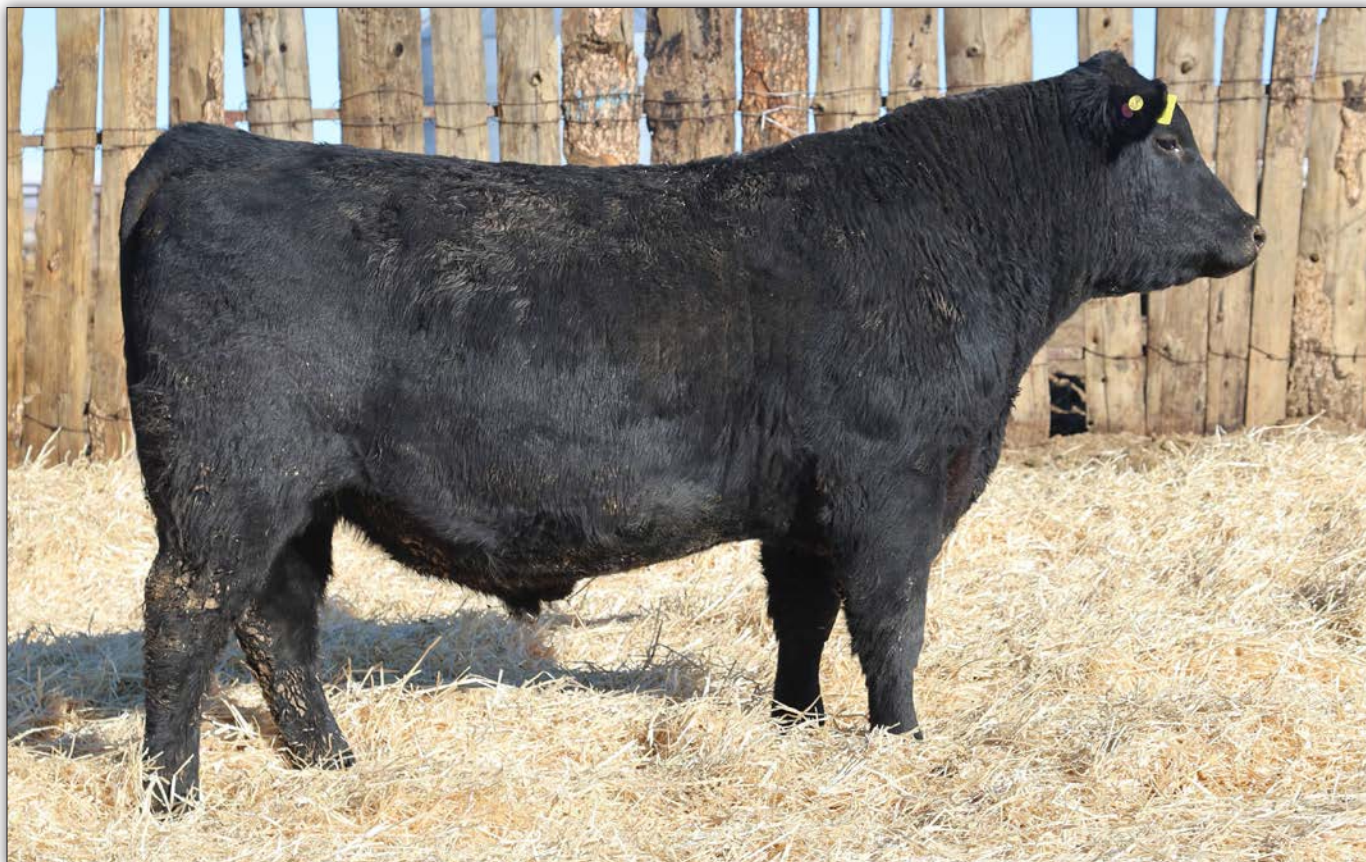
SGC CHARLO 010HB 2023 - Lot 35