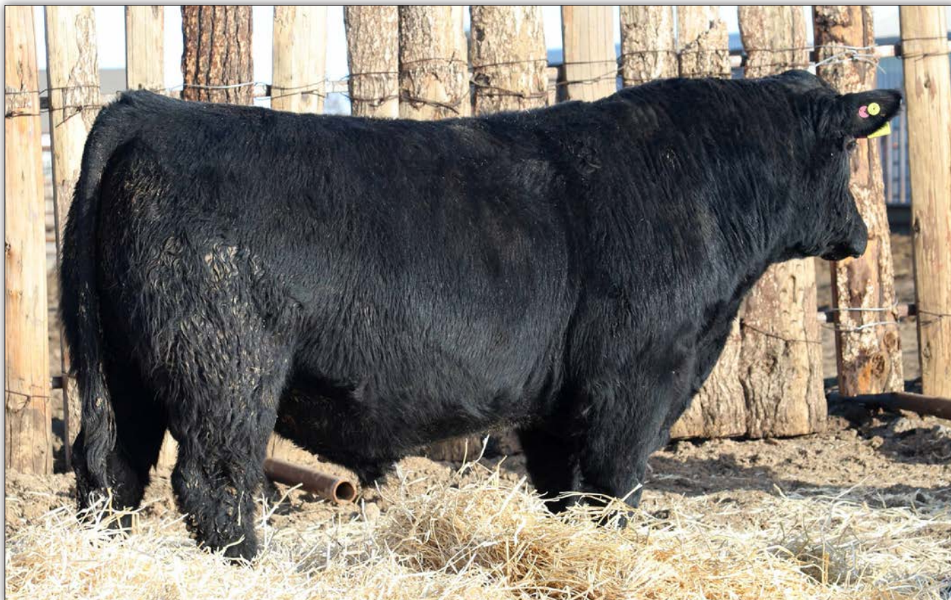
SGC CHARLO 734B 2023 - Lot 1