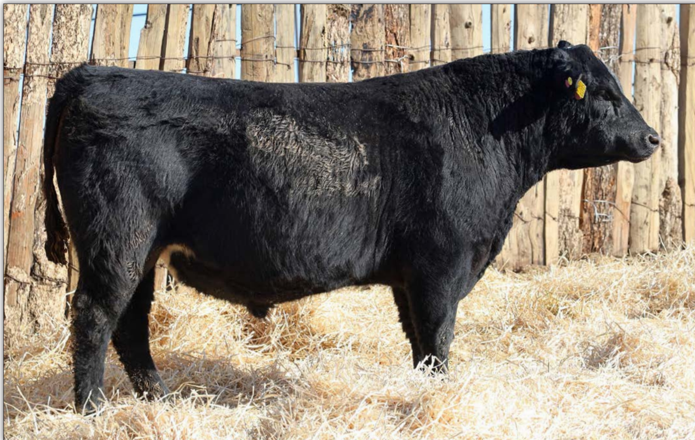
SGC CHARLO 918GB 2023 - Lot 4