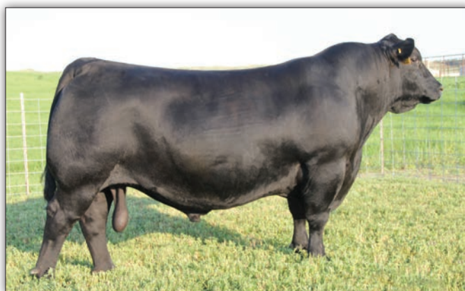
S A V RENOWN 3439 - Sire of Lots 10-15