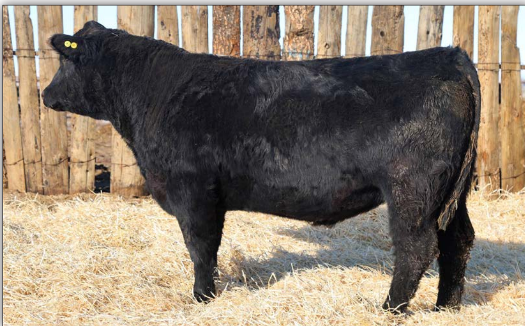
LOT 58 - 882B

LOT 58 882B BD: 4/14/2023 | 5/8 SIMM 3/8 ANGUS BULL | TATTOO: 882B