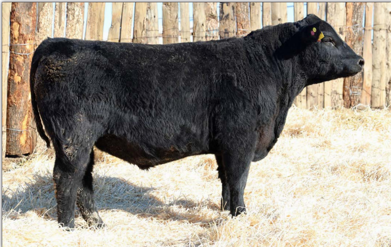
SGC CAPITALIST 716B 2023 - Lot 30