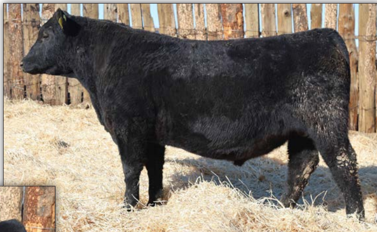
LOT 57 - 440B