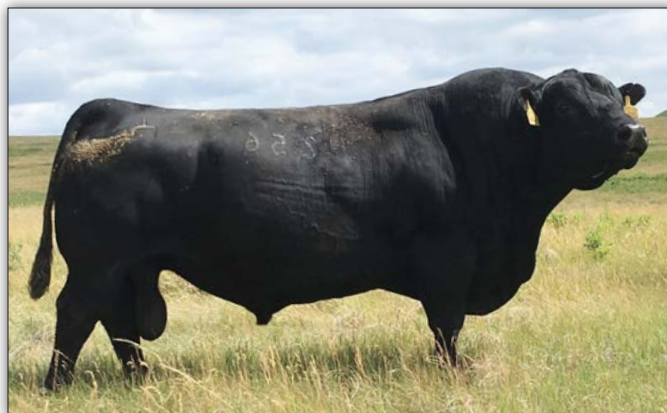
COLEMAN CHARLO 0256 - Paternal grandsire of Lots 1-9