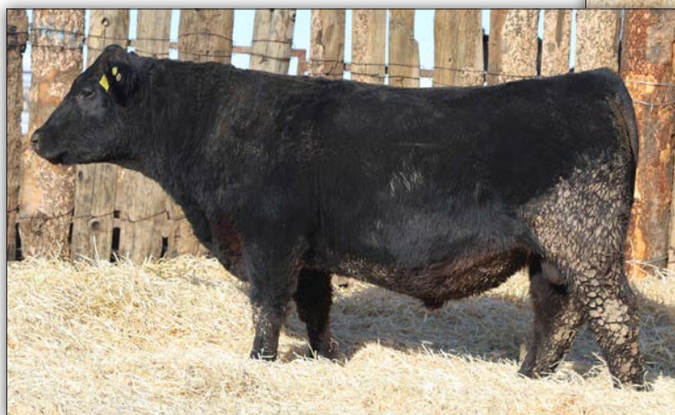
LOT 55 - 536B