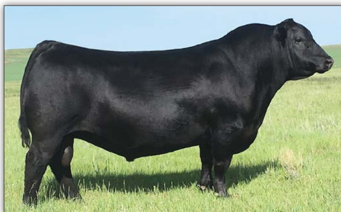
S A V PRESIDENT 6847 - Paternal grandsire of Lots 38-43