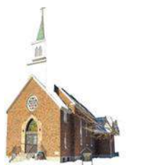
St. John's Lutheran Church Arnprior