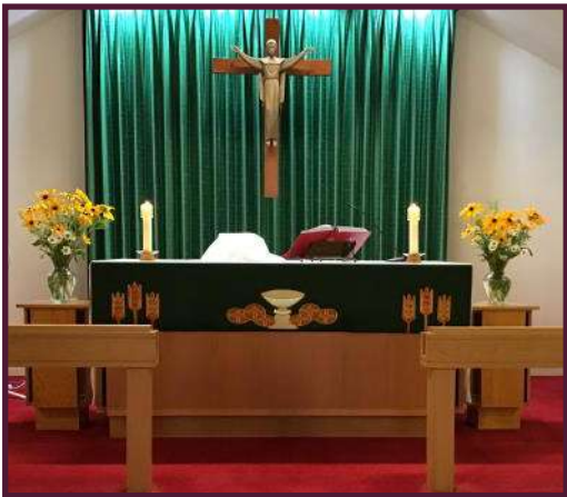
Gwen's gorgeous flowers!