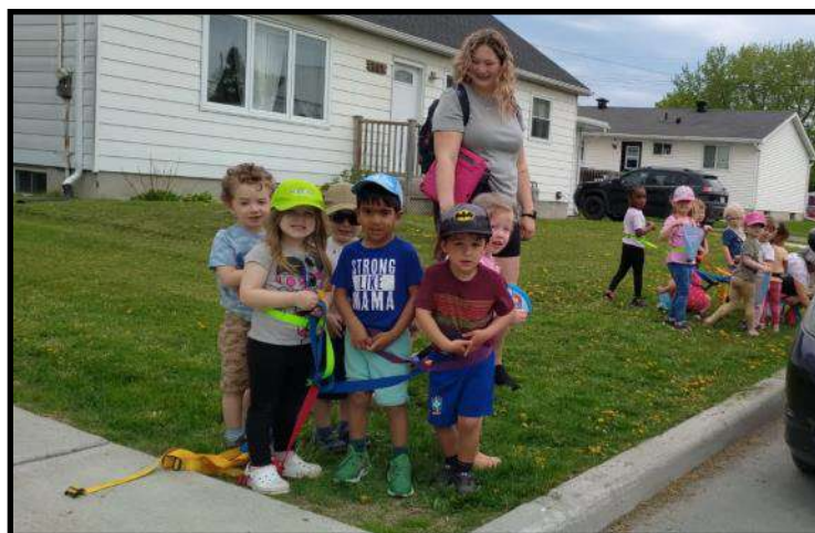
Helpful neighbours—kids picked dandelions from the church lawn.