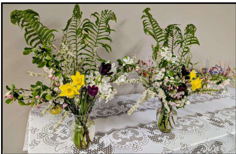
Gifts from Enid's Garden