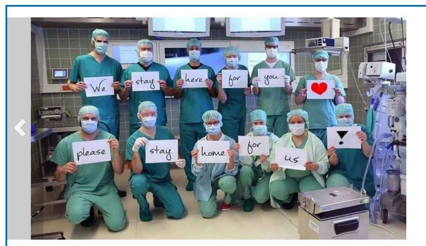
This message is being sent out by healthcare workers across the globe as governments urge residents to stay home and self-isolate to reduce the risk of infection of the COVID-19 virus.

"RNAO is asking everyone — from the doorsteps of their homes or keeping a safe distance — to cheer on the millions of health providers, social service and other essential front-line workers in Ontario, Canada and around the world who are tackling #COVID19," the organization stated on their website.