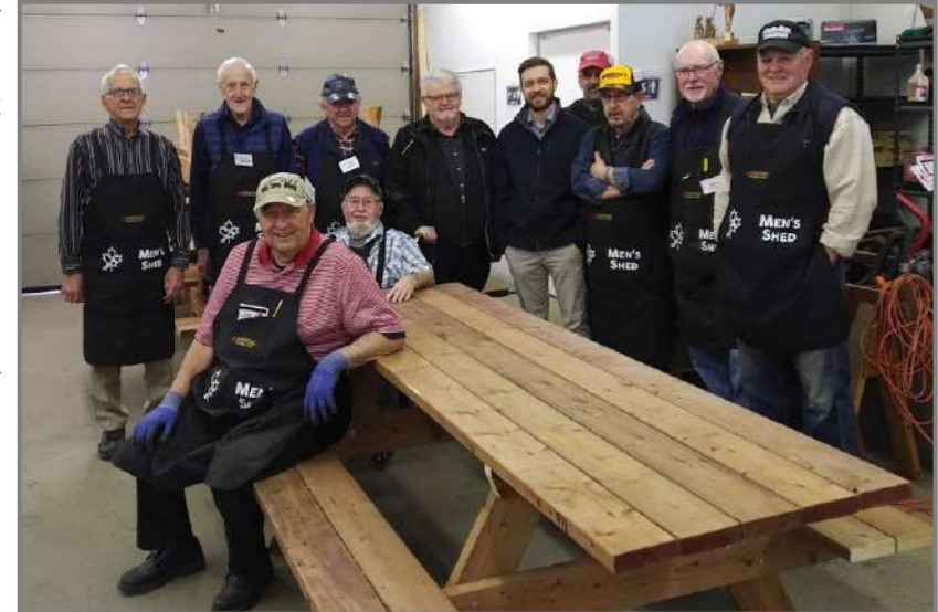
File Photo: taken before the virus outbreak (note the two guys on the left)