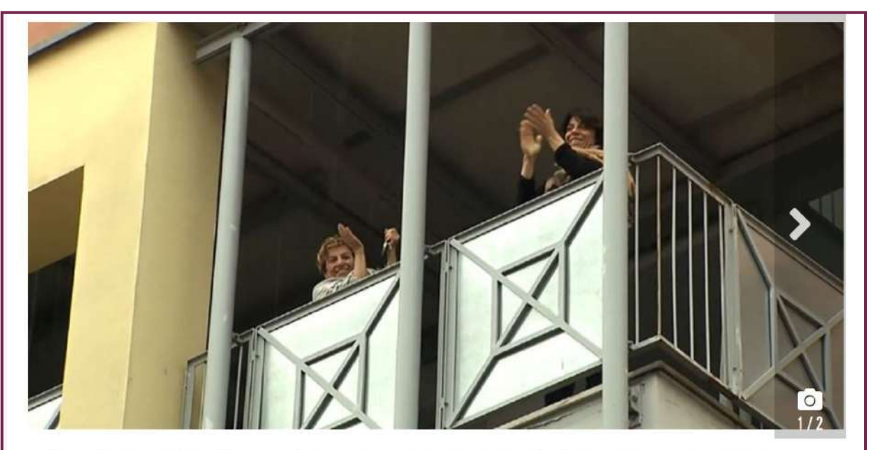
Videos of residents in Italy and Spain stepping out on their doorsteps to applaud their healthcare workers during the COVID-19 pandemic went viral on March 15. People in self-isolation all over the world are adopting the new tradition to show their gratitude to those working hard to end the pandemic.

On March 19, the Registered Nurses Association of Ontario (RNAO) made an announcement asking all Ontarians to help thank and support our nurses, doctors and other health care workers for their ongoing efforts during the COVID-19 pandemic.