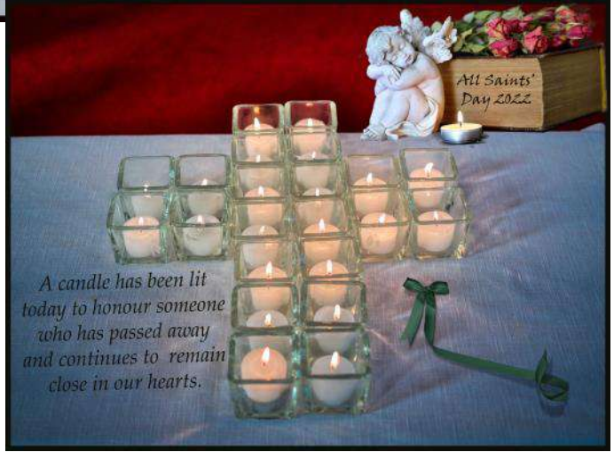
All Saints Day Candles.