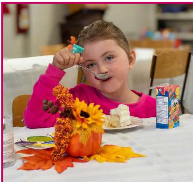
Phoenix enjoying some cake at coffee hour.