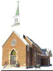
St. John's Lutheran Church Arnprior