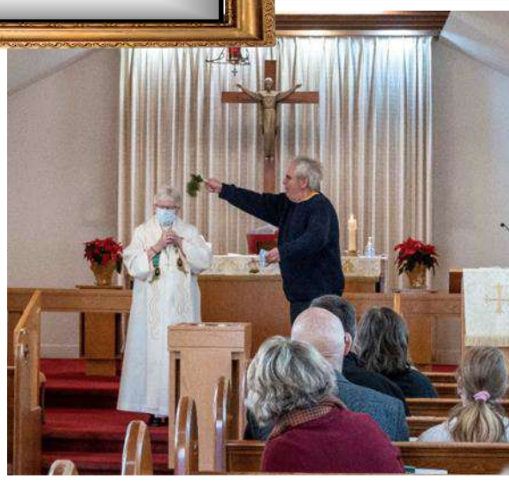
January 9 th Baptism time for Pastor