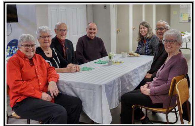
Social followed the Service