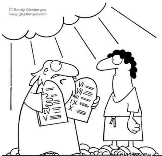
“I downloaded them from a cloud.”