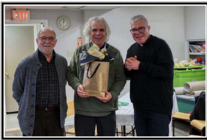
Presentation of a Gift to the Bishop