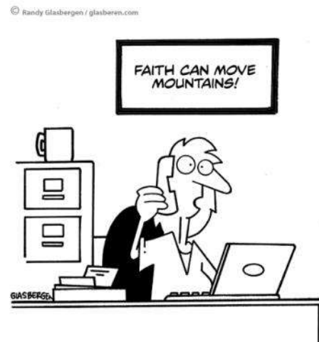
“Acme Excavating. Faith speaking.”