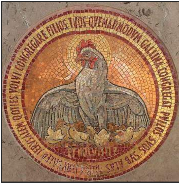
God as mothering hen mosaic from an altar in Jerusalem.