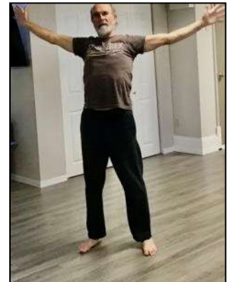
Guys welcome too