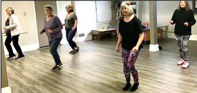
Fun! Who do you know here?