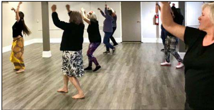
Now we're getting it!