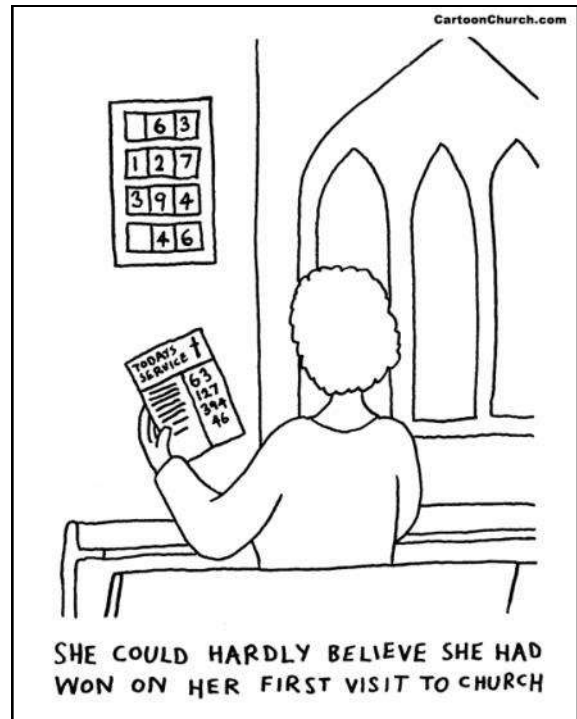
SHE COULD HARDLY BELIEVE SHE HAD WON ON HER FIRST VISIT TO CHURCH