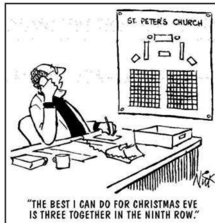
"THE BEST I CAN DO FOR CHRISTMAS EVE IS THREE TOGETHER IN THE NINTH ROW."