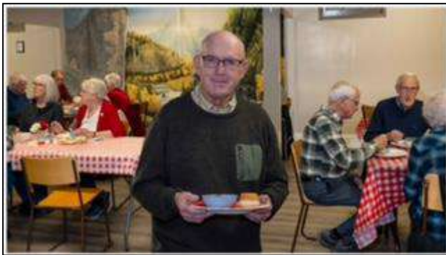
"Hurry up—take the picture—I'm hungry!"