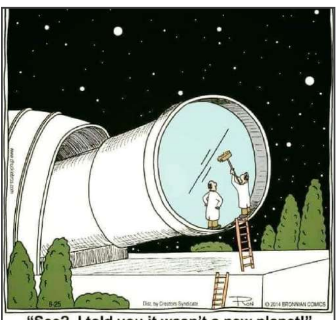
"See? I told you it wasn't a new planet!"

So that is it for now. And remember those shepherds, because you will never see a miracle unless you look for one!