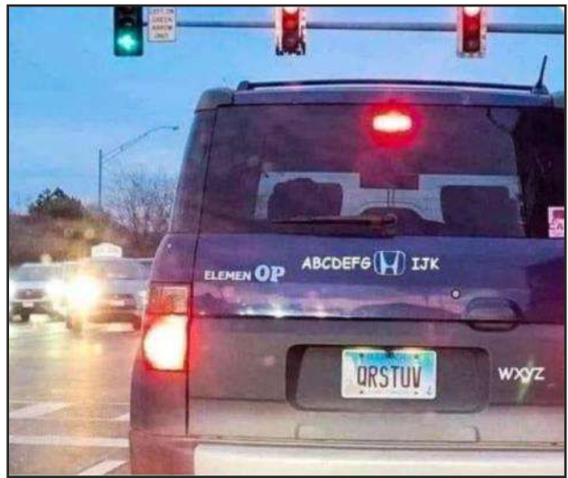
Gotta admire the creativity!