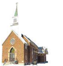
St. John's Lutheran Church Arnprior