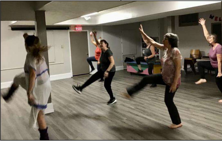
Movimento Dharma dance group in action