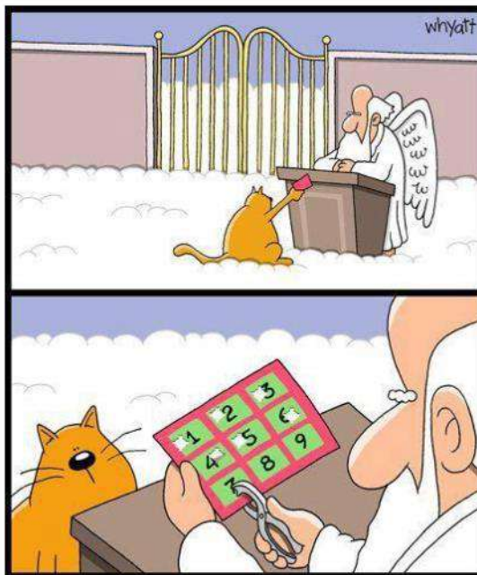
What happens when a cat shows up in heaven