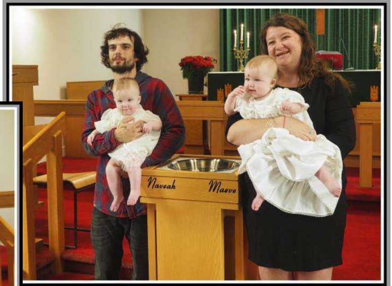
McTeer twins' baptism on Oct 15 th

Special thanks once again to Keith and Beryl for their time and efforts. Once again the church was well staged with harvest foods and flowers