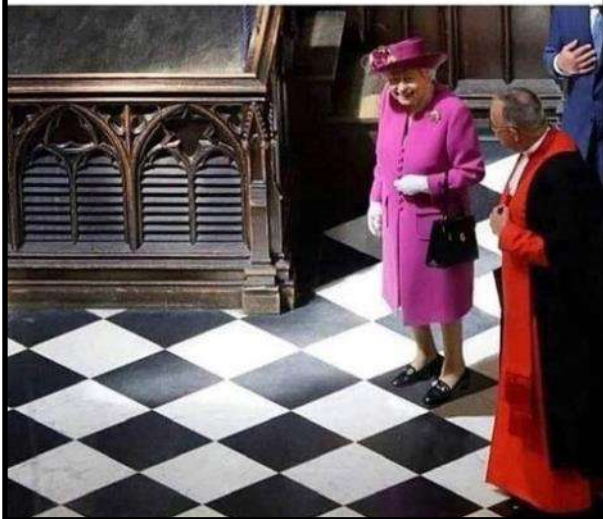
A moment of tension in Vatican. If the bishop moves forward the queen can take him.