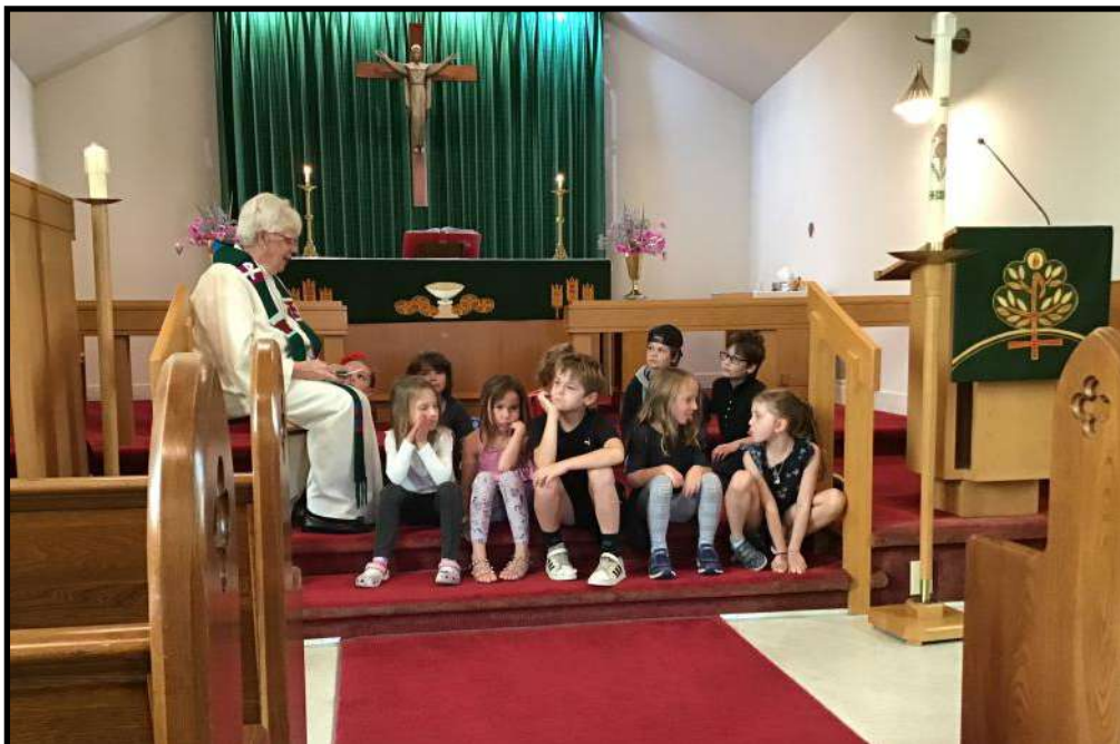
Pastor giving the children's message.