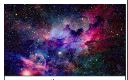
4—Sept 25<sup>th</sup>: COSMOS Sunday

the Season of Creation that was developed by two churches in Australia: the Lutheran Church and the Uniting Church. Hymns will be selected to support the specific creation theme. On three of the five Sundays we are inviting youth from our parish and from the UNPLUG program to participate; those will be a Service of the Word.