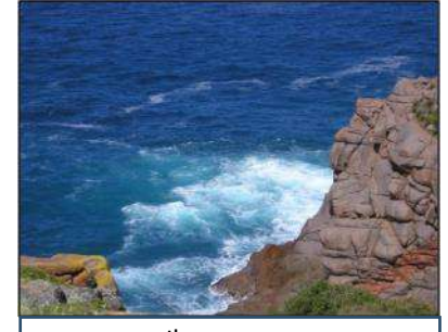
1—Sept 4<sup>th</sup>: Ocean Sunday

relationship with the whole creation. Most commonly, the Season of Creation is celebrated between Creation Day on September 1 and St Francis of Assisi Day on October 4; an optional Sunday can be added after October 4. (By the way, did you know that St. Francis is the patron saint of animals and the environment; it is customary for many churches to hold ceremonies blessing animals on his feast day of October 4.)