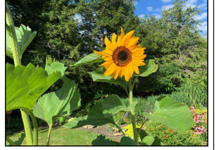
in Ukraine since the mid-18th century, according to a 1993 Encyclopaedia of Ukraine . At the time of the book's publication, sunflower seeds were the country's

FACT - The flower has an even longer history in the country. Sunflowers— soniashnyk in Ukrainian—have been grown