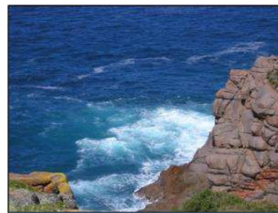
1—Sept 4 th : Ocean Sunday

the Season of Creation that was developed by two churches in Australia: the Lutheran Church and the Uniting Church. Hymns will be selected to support the specific creation theme. On three of the five Sundays we are inviting youth from our parish and from the UNPLUG program to participate; those will be a Service of the Word.