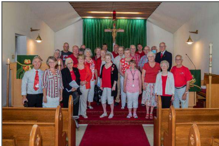
July 3 Red and White time together!