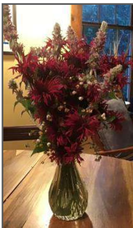
Flowers like these returned to beautify our worship in the summer.