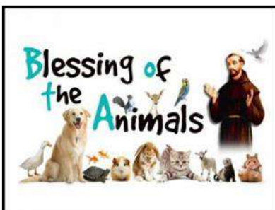
5—Sept Oct 2 nd : Blessing of the Animals