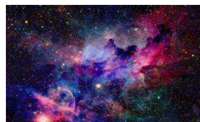
4—Sept 25 th : COSMOS Sunday