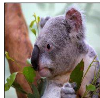
2—Sept 11 th : FAUNA & FLORA Sunday (Youth)