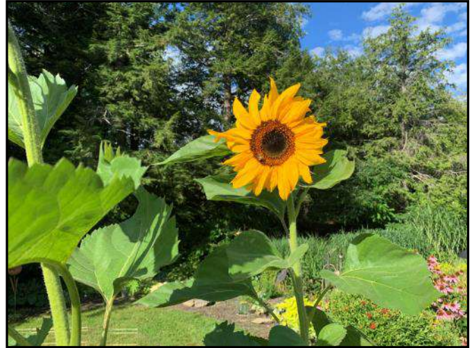
From her garden.

FACT - The flower has an even longer history in the country. Sunflowers— soniashnyk in Ukrainian—have been grown in Ukraine since the mid-18th century, according to a 1993 Encyclopaedia of Ukraine . At the time of the book's publication, sunflower seeds were the country's most popular snack. The flower also helps fuel the national economy today; Ukraine and Russia supply up to 70–80% of the world's sunflower oil exports.