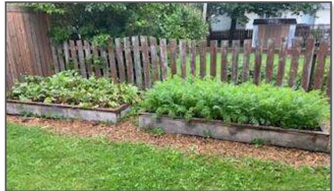
This year's garden, nearly ready for harvest.