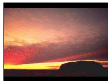
3—Sept 1 th : STORM Sunday (Youth)