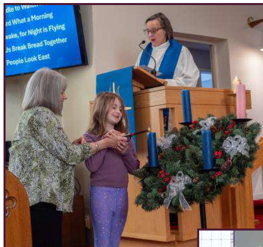
Advent Candle Lighting