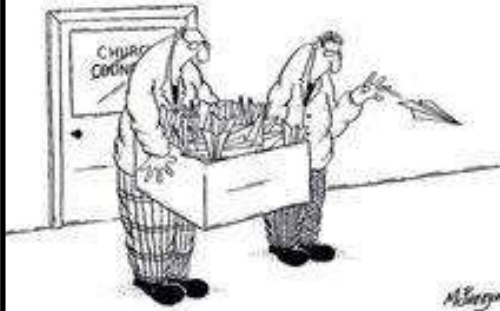
"Remind me never to ask the Youth Group to help fold the church bulletins again."

Did you know that French fries weren't cooked in France? They were cooked in Greece.