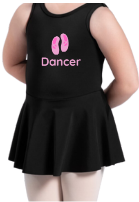
Black or Pink solid colored leotard (Personalized)