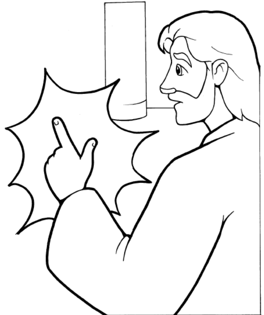
Jesus Appears to the Disciples