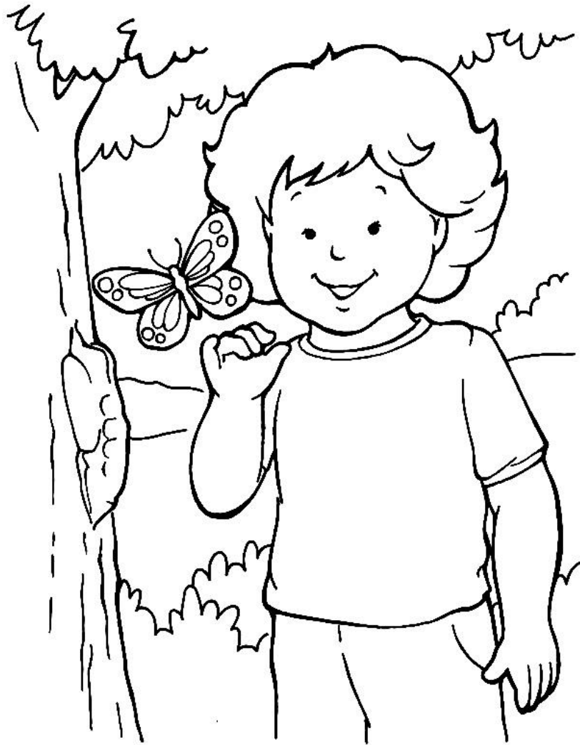
Jesus is special. He can do miracles.

From Thru-the-Bible Coloring Pages for Ages 4-8. © 1986, 1988 Standard Publishing. Used by permission. Reproducible Coloring Books may be purchased from Standard Publishing, www.standardpub.com