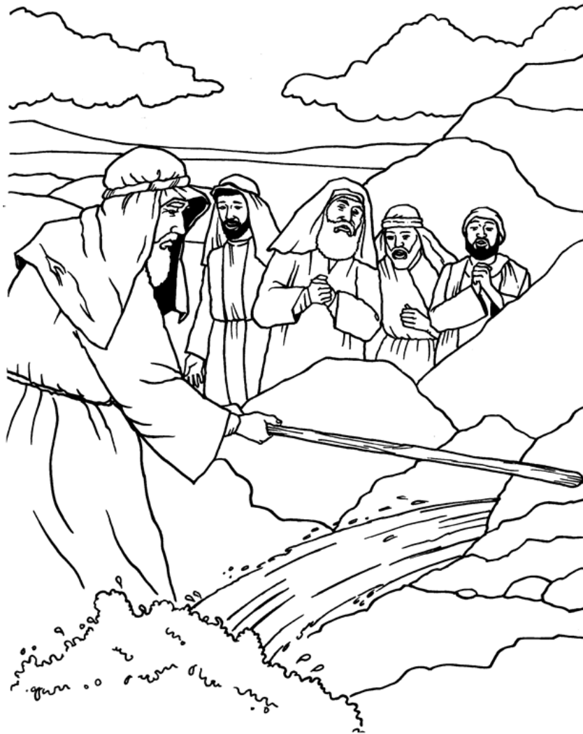
Moses Strikes the Rock Exodus 17:1-7