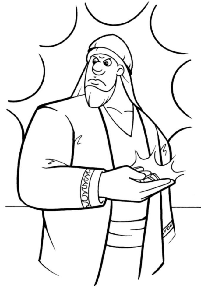
Parable of the Talents (Matthew 25:14-30)

JOURNEY WORTHLESS TALENT MASTER SERVANT PROPERTY SHARE MONEY ABILITY WICKED FAITHFUL WEeping GAINED HAPPINESS LAZY ENTRUSTED