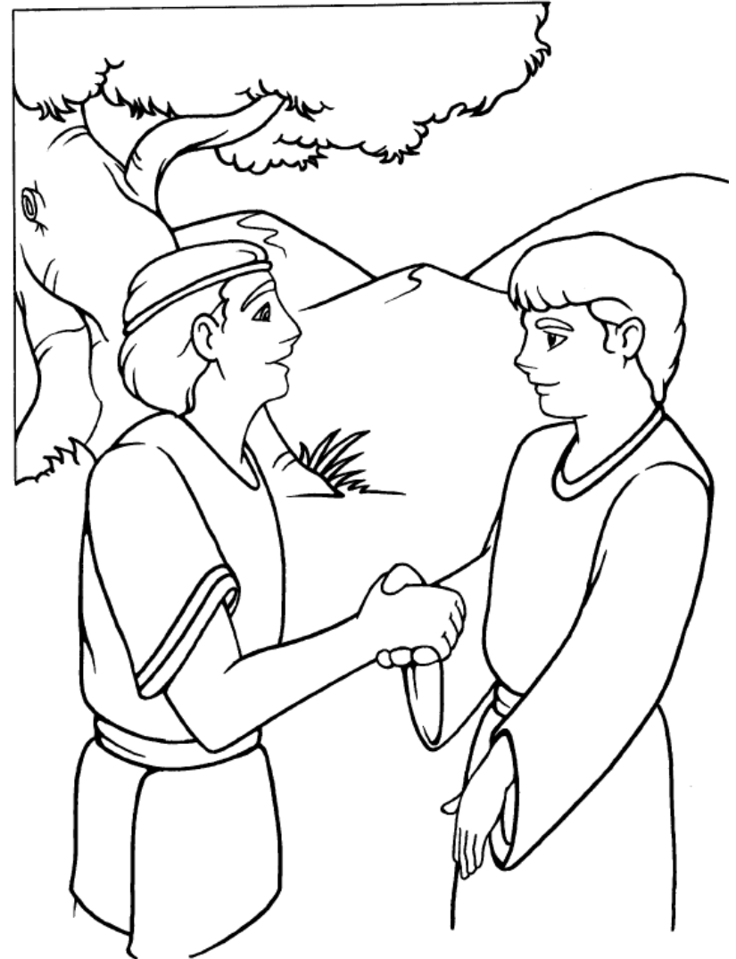
Esau Sells His Birthright to Jacob Genesis 25:19-34

Q B T G Y H B W R N N G O F S P I W O X S I S A A C C T E T K R O W D C O O K I N G W R A F T S N B U A S O J M B I N R W H B K O P S H Q P Y L N U V B R N T E J B K P L I H S R I O I V P R O J T K T D S E C N Y G G E C C D R N A K T T B G S H L A A U X E E H N H D P S K T J S M Z L R G U N F I Q C V A E M U Y B C H B I Z E M R O C E S A U V T S D A I V J J G H S J K Q P I F T Q K O U C S W I L Y Q H O M E E U Z Z W Q F E V R E B E K A H W E I T