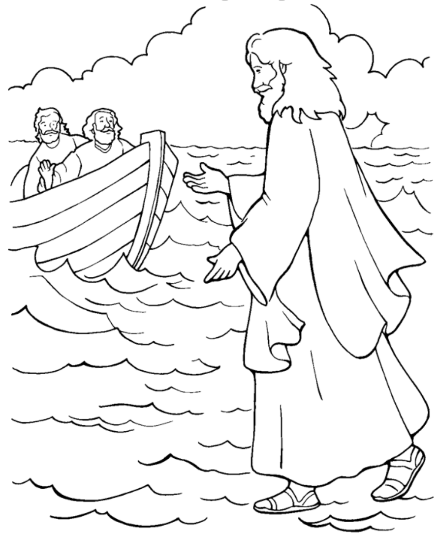
Jesus Walks on Water

AFRAID WIND WALKING BLOWING JOINED BOAT LAKE STRONG JESUS DARK WATER EVENING