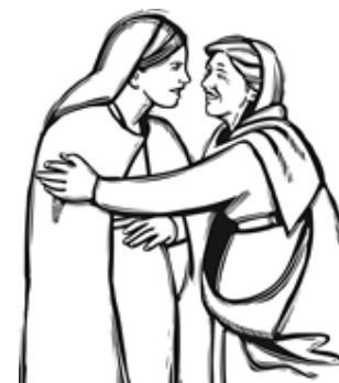
Mary Visits Elizabeth

ELIZABETH PROMISES MARY JOY LEAPED MOTHER BABY WOMEN BLESSED FULFILL