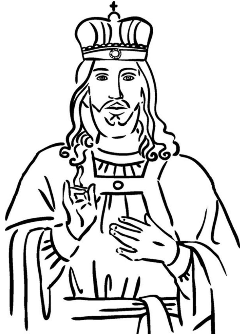
Christ the King John 18:33-37