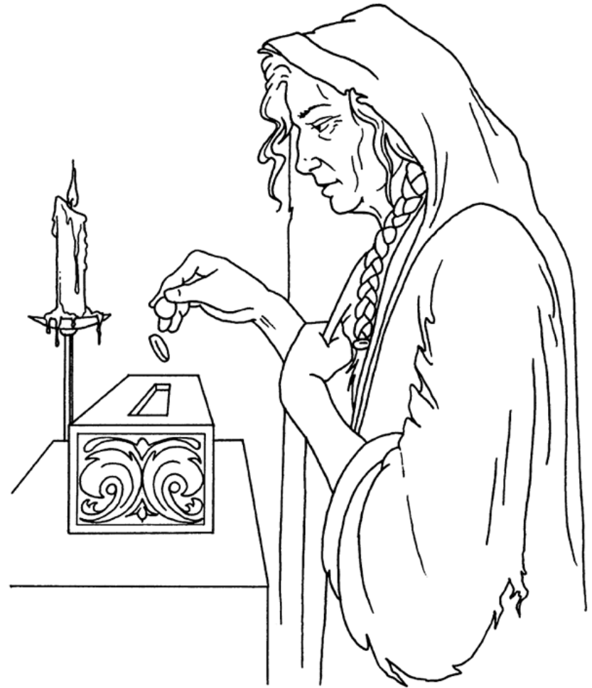
The Widow's Mite