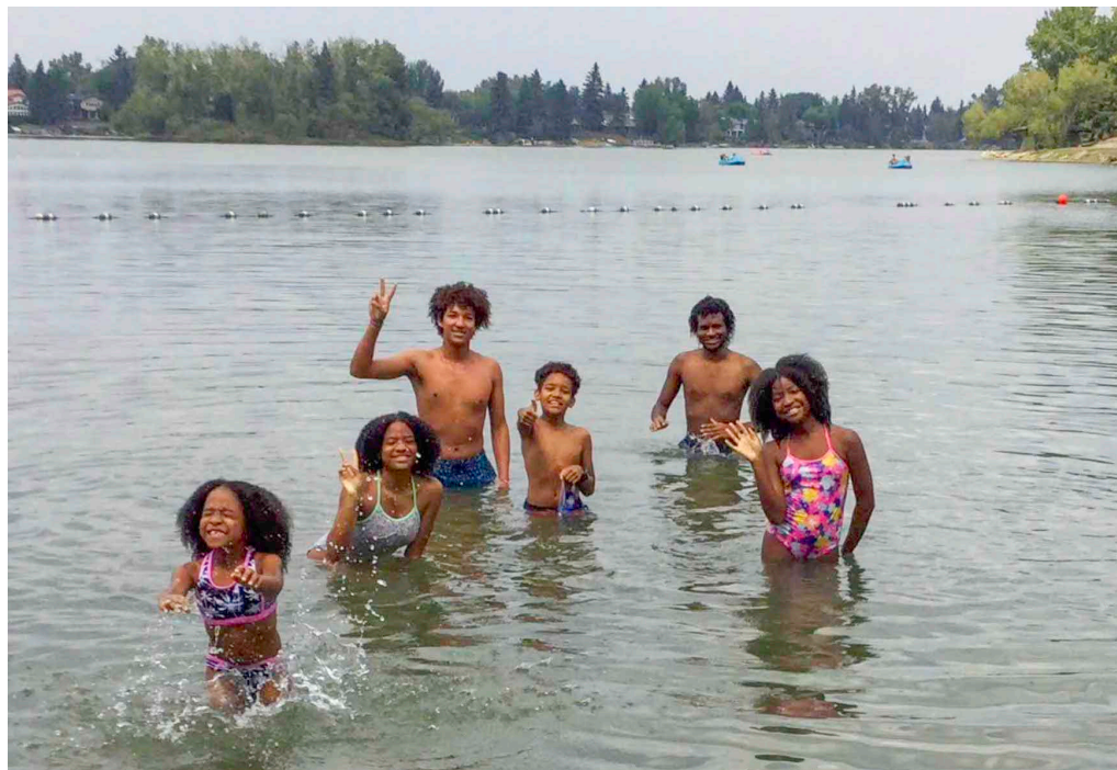
Angolan children enjoying some sun and fun at Lake Bonavista

Please label your contribution as "Refugee Fund".